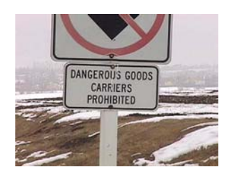
RB-70T 60x 30 cm by